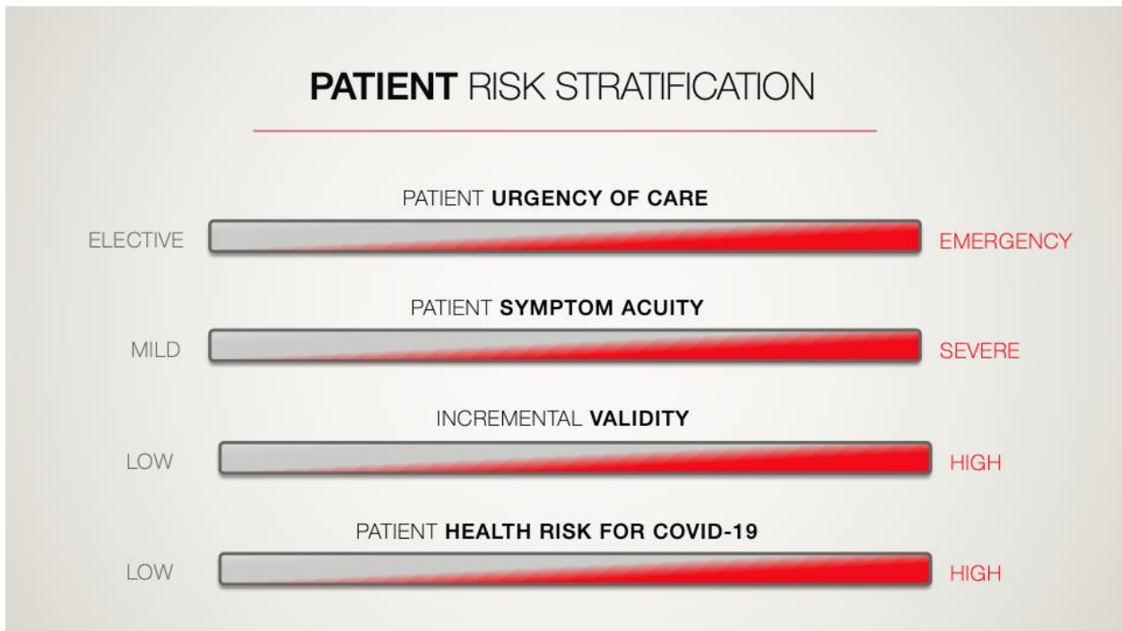
Figure 1. Patient Risk Stratification

Considering the benefits of neuropsychological assessment in the context of the risks of in-person practice during the pandemic, as mitigated by the various models for assessment noted above, is a complex process, and involves at least four different factors.